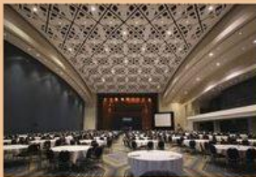
WASHINGTON STATE CONVENTION CENTER, SEATTLE

While Seattle currently gets about 70 percent of its convention business from associations, especially medical, the expansion will boost the city's ability to accommodate more short-term corporate